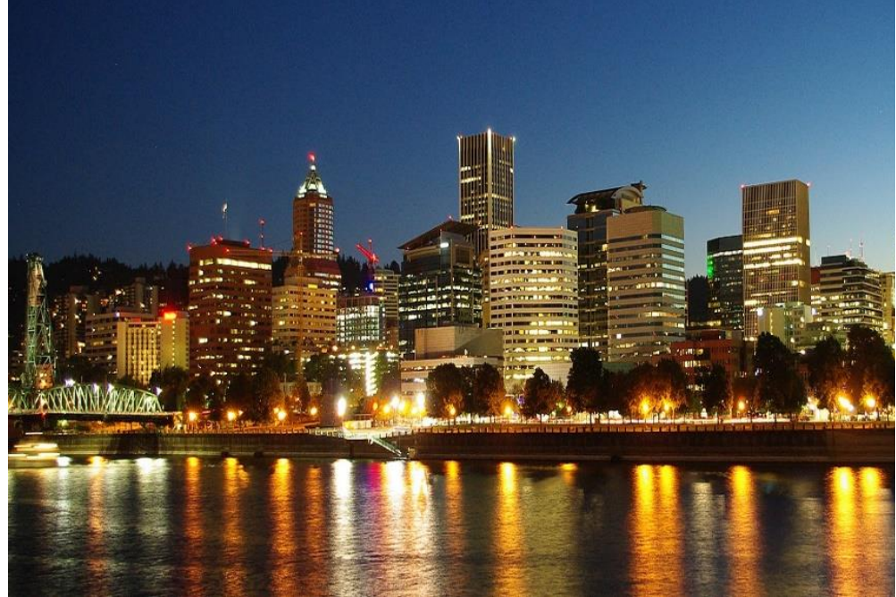
Photo by M.O. Stevens - Own work, CC BY-SA 4.0, https://commons.wikimedia.org/w/index.php?curid=60792488

Send River Notes feedback to <u>twege@ccga.edu</u> please feel free to suggest topics in addition to any other items for inclusion in River Notes.