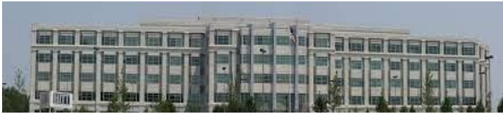
Dulles Discovery Building