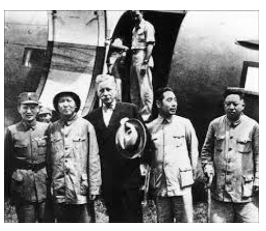
First Meeting with Communists