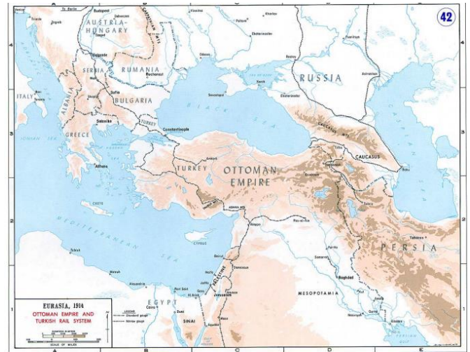
The views, opinions, and findings of the author expressed in this article should not be construed as asserting or implying US government endorsement of its factual statements and interpretations or representing the official positions of any component of the United States government.