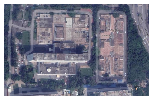
Research and Analysis Headquarters New Delhi

The ISI Reaches East: Anatomy of a Conspiracy