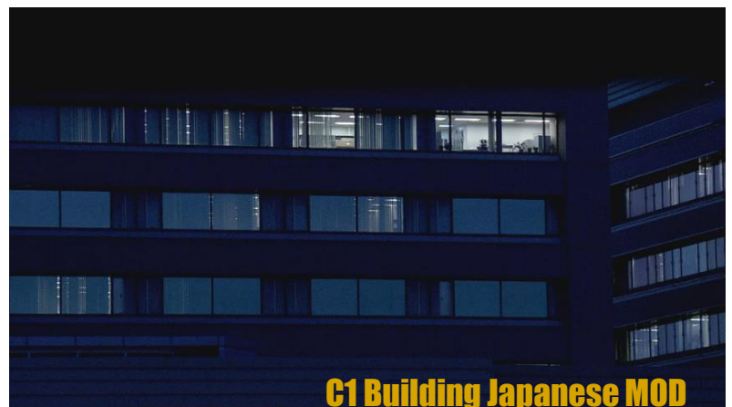
C1 Building Japanese MOD