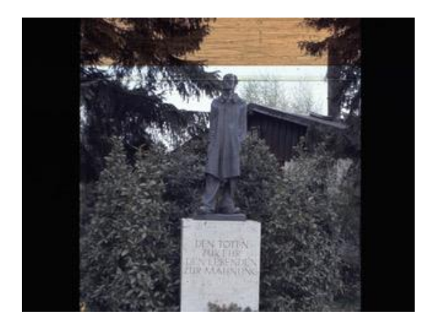
Dachau concentration camp May 1965. translation "The dead in honor of the living as a reminder."