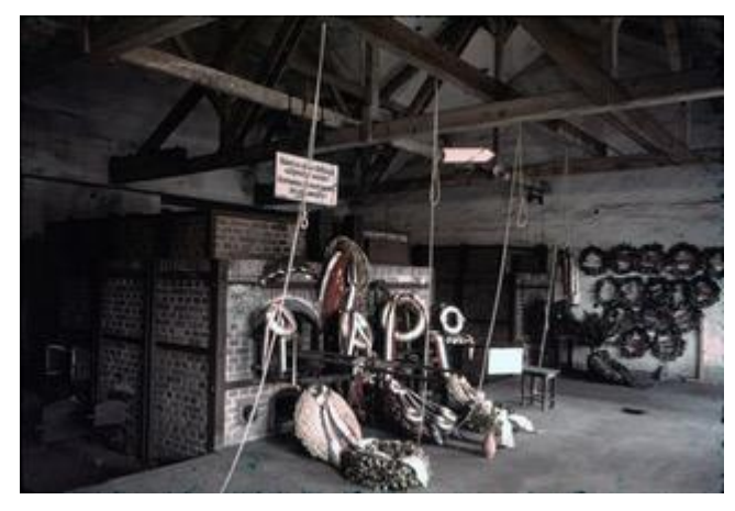
Two of the ovens in one of the crematoria at Dachau, May 1965