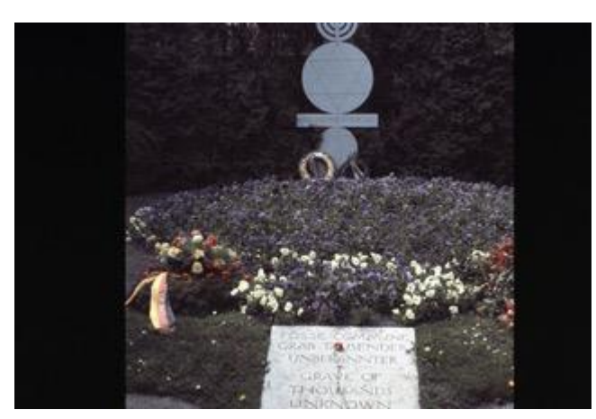
Grave of thousands of unknown victims at Dachau, May 1965