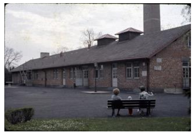
One of the buildings at Dachau, May 1965

Memorial at Dachau May 1965. Russian Orthodox Approximate